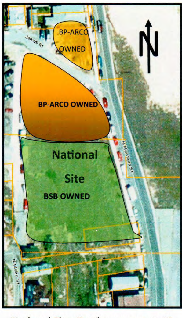
National Site: Total acreage = 1.15