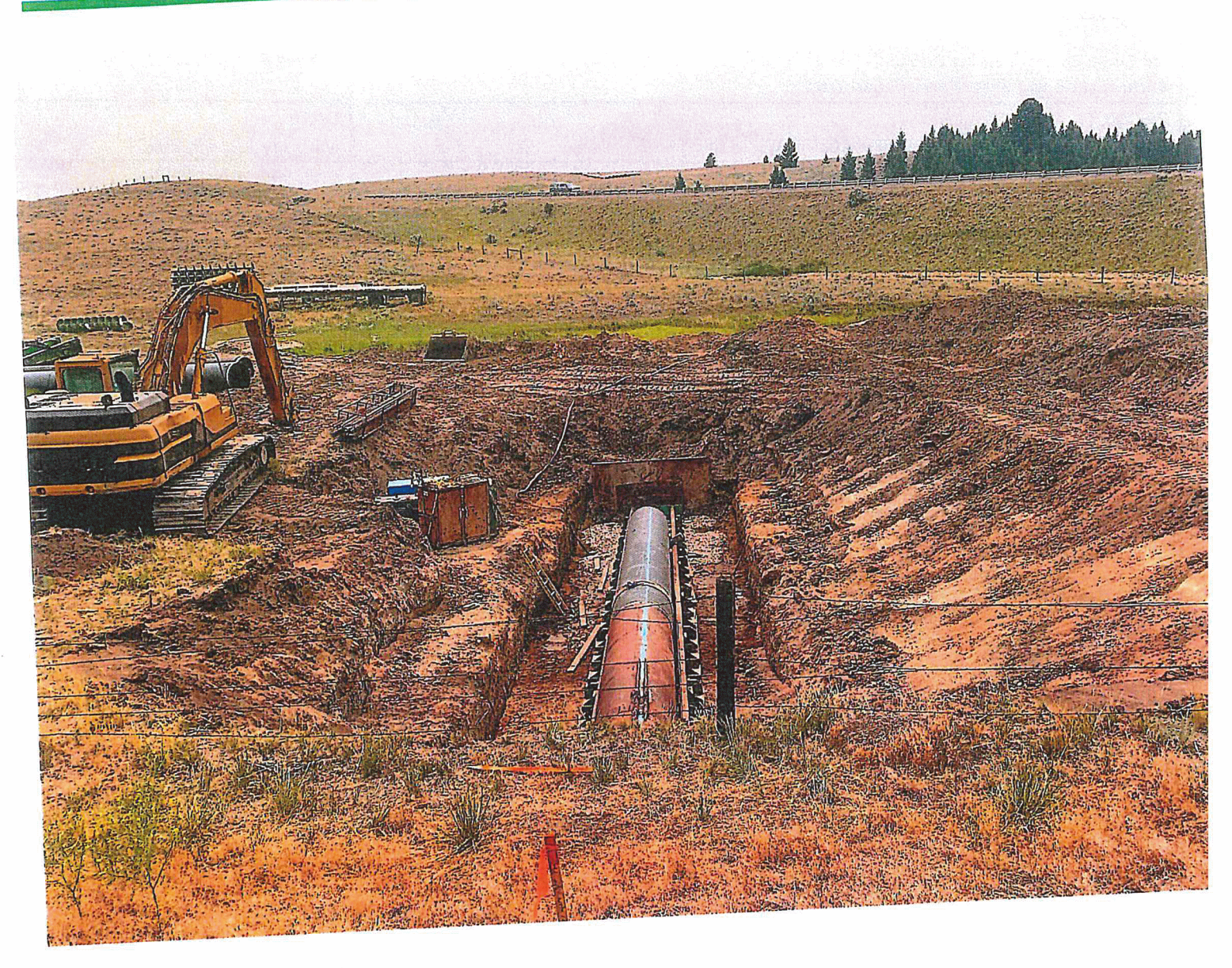
Frontage Road bore entry pit