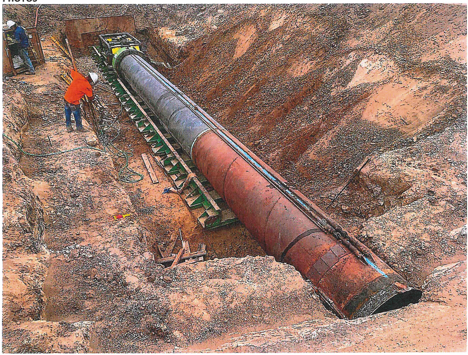
48" steel casing prepared for Jack and Bore installation at station 32+35