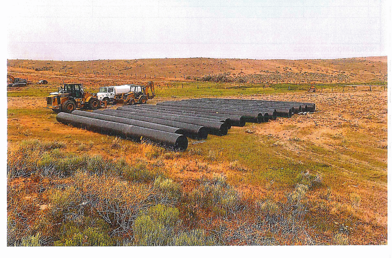
Stage 36" HDPE pipe at Frontage Road site