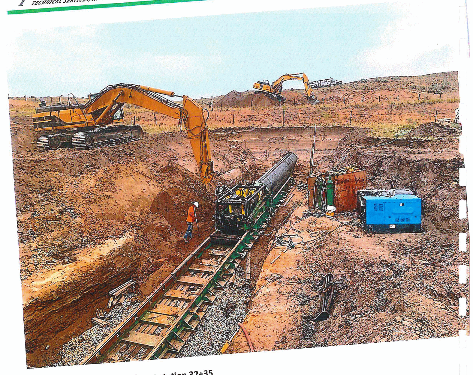
Installation of 48" steel casing at station 32+35