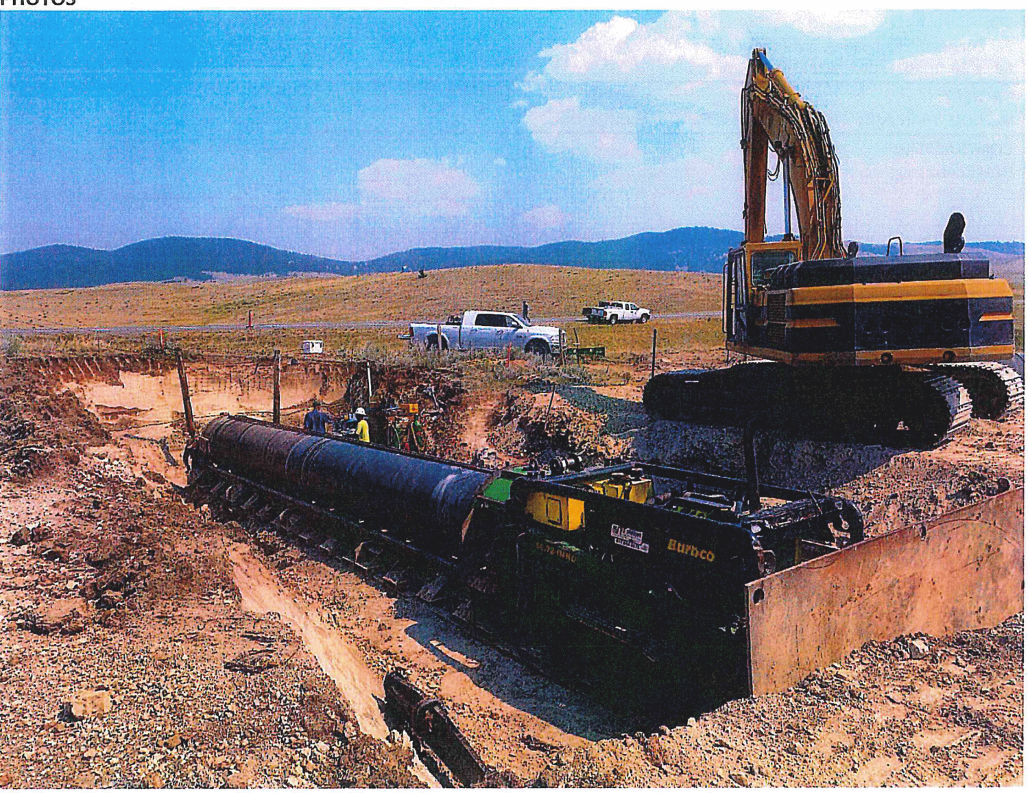
Coleman Construction excavates prepares for I-15 South Bound bore near station 0+57