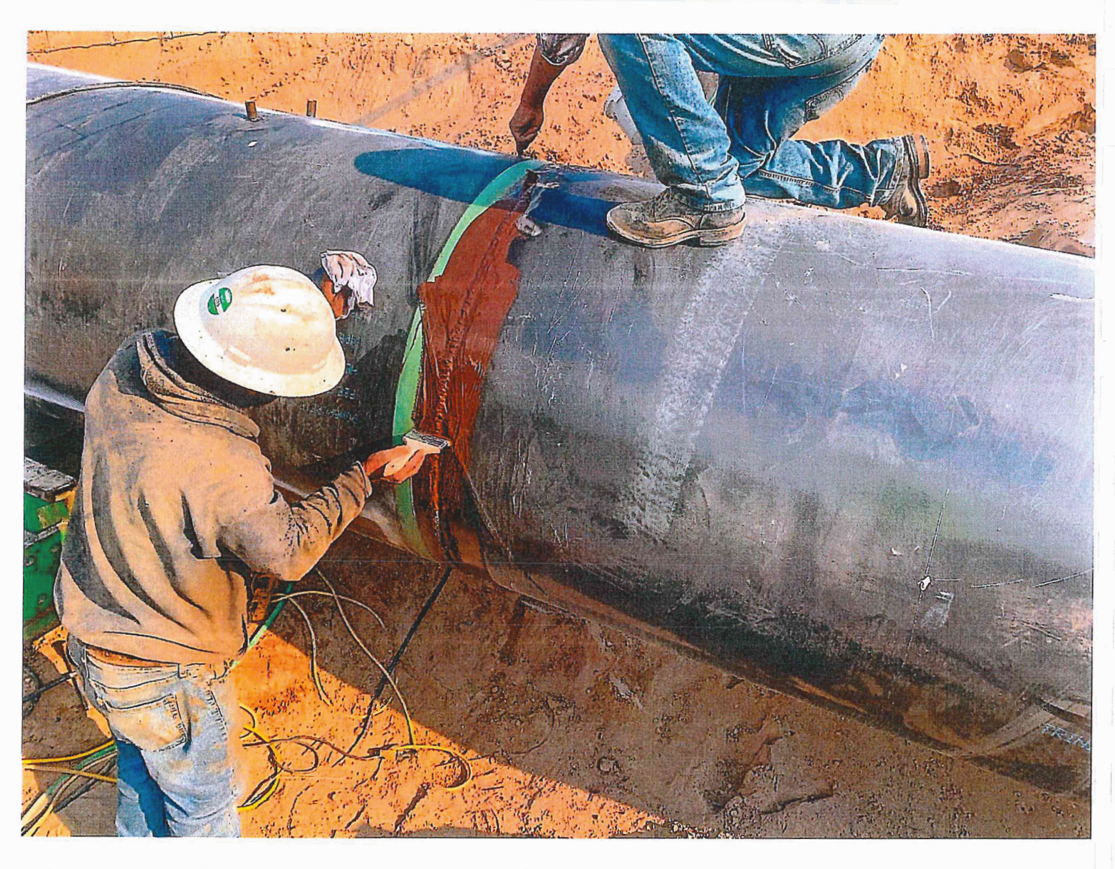
Coleman Construction applies Powercrete J to welded casing at station 28+63