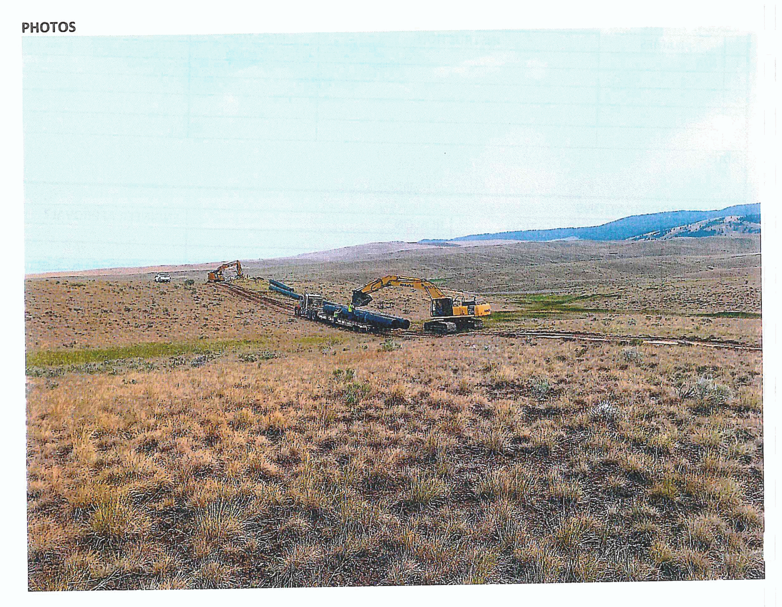
H&H contracting staging 36-inch HDPE pipe along alignment