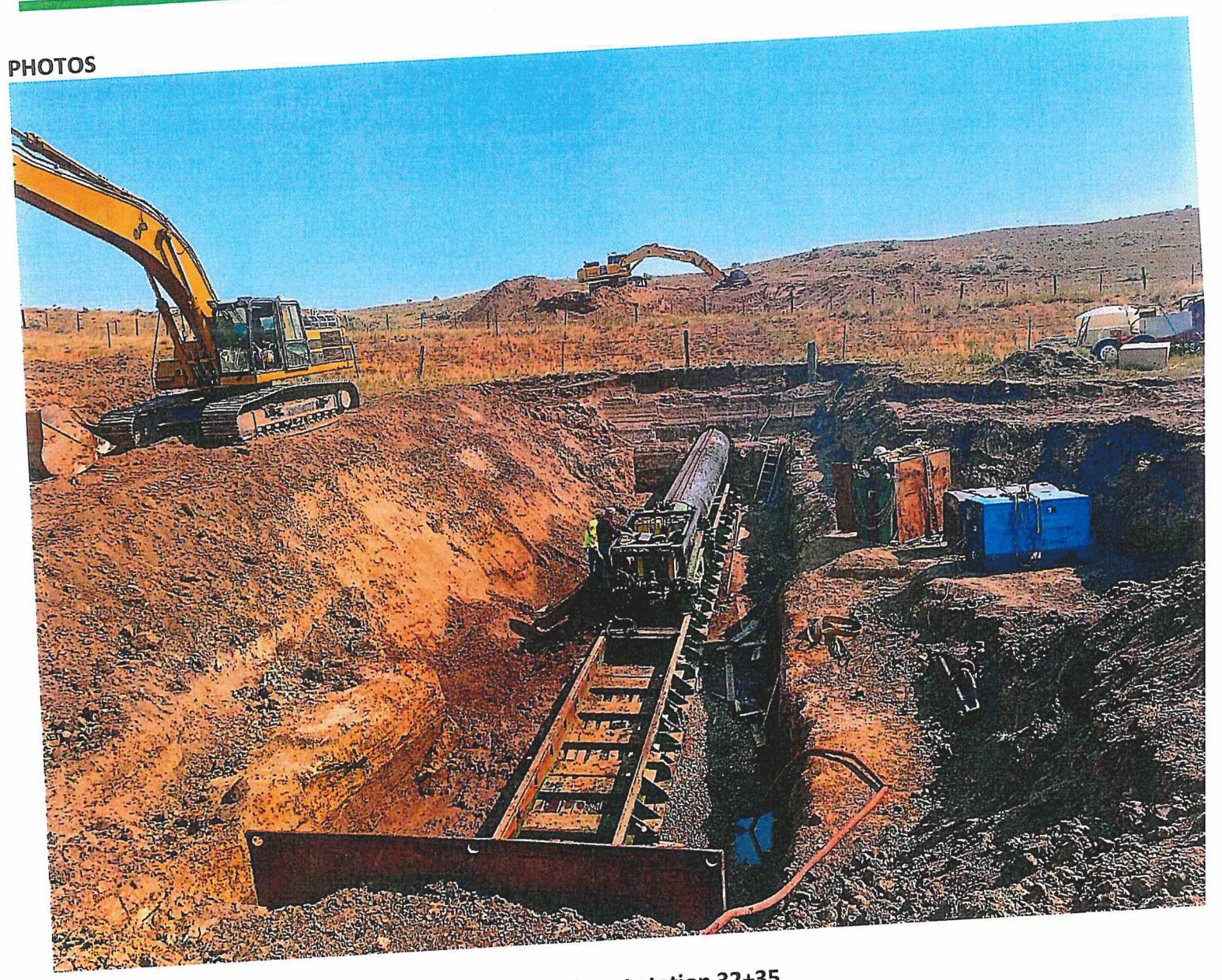
Coleman Construction Jack and Bore 48" steel casing at station 32+35