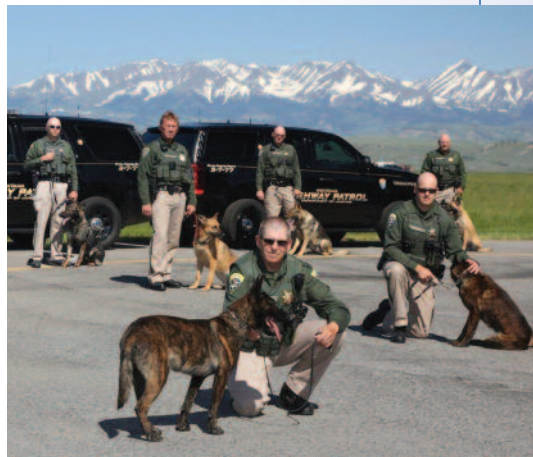
MHP's K-9 units.

(See page 13 for more information on the 24/7 Sobriety Program.)