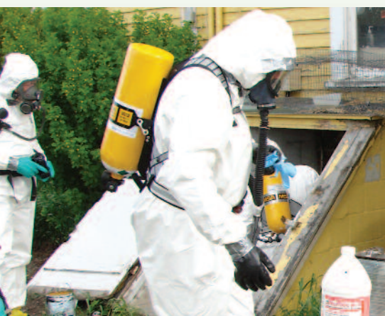
DCI agents dismantle a clandestine meth lab.

With assistance from the Governor's Office, short-term funding was obtained to hire and station two DCI agents in Sidney, and additional DCI agents from Billings and Miles City were tasked with concentrating investigative efforts in this region of the state, which lacks full-time drug enforcement officers at the local, state, and federal level. As a direct result of those efforts, DCI, in conjunction with other law enforcement agencies, initiated approximately 90 new drug investigations relating to the Bakken, primarily concentrating on the upper-level, major drug trafficking organizations operating there with ties to documented out-of-state and international drug cartels.